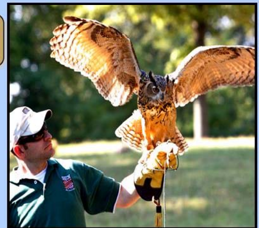
Bob Tarter with "Elliot" our Eagle Owl

Wildlife programs feature at least 5 live animal exhibits, subject to availability